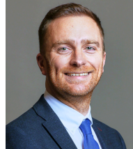
Matt Vickers MP (Chair)