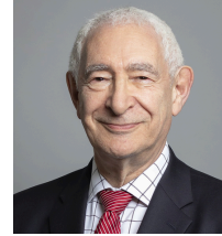
Rt Hon The Lord Triesman (Member)