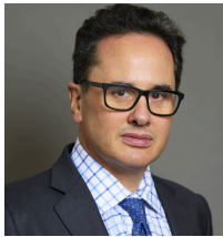
Rt. Hon. Viscount Camrose (Member)